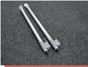
Adjustable Corner Bars

These are the parts included. Should any parts be missing or damaged please contact us directly.